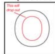
All lines cut, internals will drop out unless a tack bridge is used! Incorrect way!